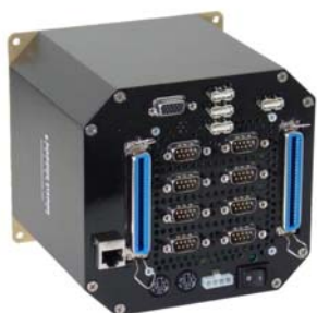
Pandora cable-free enclosure system for Helios CPU

All I/O on Helios is made available on 2mm pitch pin headers for use with low-cost cables. To enhance the use of Helios in harsh environments requiring outstanding resistance to shock and vibration, Diamond Systems offers our rugged Pandora PC/104 enclosure that provides a cable-free configuration via a small panel I/O board that installs directly on top of the Helios to instantly convert all I/O to PC-style connectors: